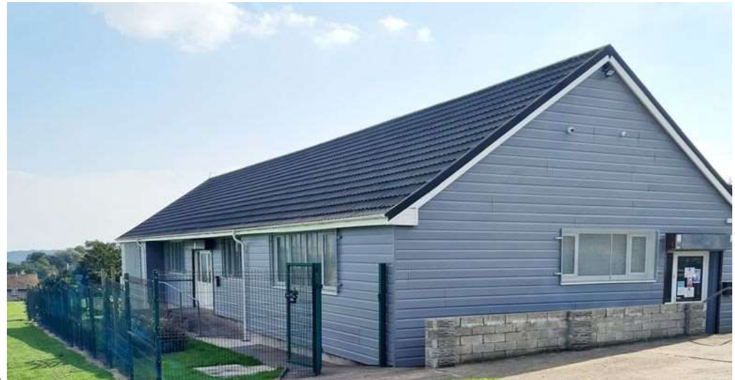
Bryntirion & Laleston Community Centre after Cladding