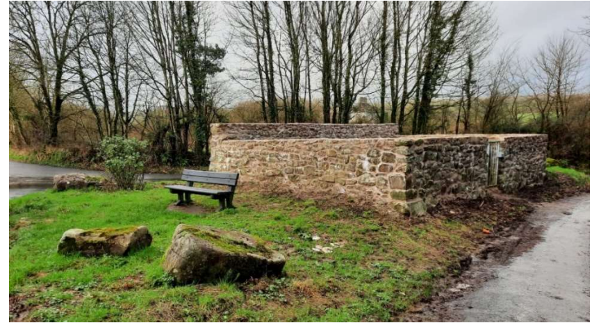
The Pound following renovation