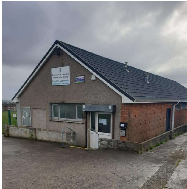
Bryntirion & Laleston Community Centre before cladding

Following the asset transfer and refurbishment undertaken by LCC on the interior of the Community Centre, Council took steps in 2021 to insulate the building to reduce energy costs and therefore make the building more energy efficient. In addition to improving the thermal insulation, the building is now also more aesthetically pleasing.