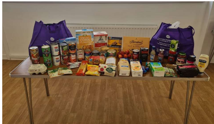
An example of bag contents at the Community Pantry