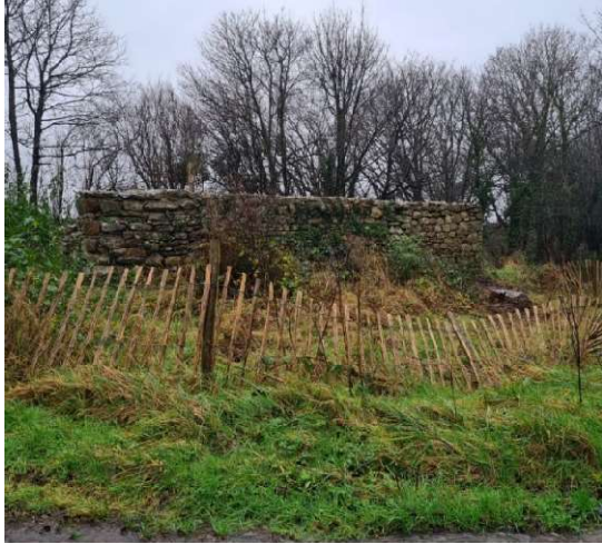
The Pound before renovation

LCC commissioned renovation works on the 'Pound', which were completed in early 2022. The efforts were initiated to preserve this site of historical interest for many more years.