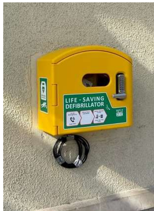
Defibrillator on Gentle Way, Broadlands

In addition, Council held several free training sessions which were open to the community on how to safely use a defibrillator and basic life support.