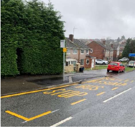
Bus stop on Merlin Crescent