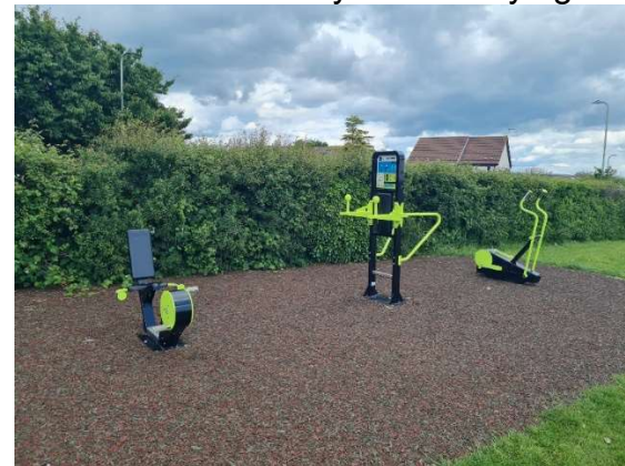
Exercise equipment at Bryntirion Playing Fields

During 2021, LCC installed outdoor exercise equipment next to the teenage park in Broadlands and in Bryntirion Playing Fields, which Members thought would be beneficial to all users to assist people to stay active and maintain physical and mental health. Due to the close siting of the exercise equipment in Bryntirion to a children's play park, it is a great way for parents with both young and older children to get out and exercise together.